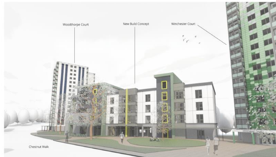
Woodthorpe & Winchester Court, Nottingham Artists impression showing new build scheme in context of refurbished towers VIEW 1

Draft concepts for Woodthorpe and Winchester with the four storey 39 unit new build extra care unit in the centre.